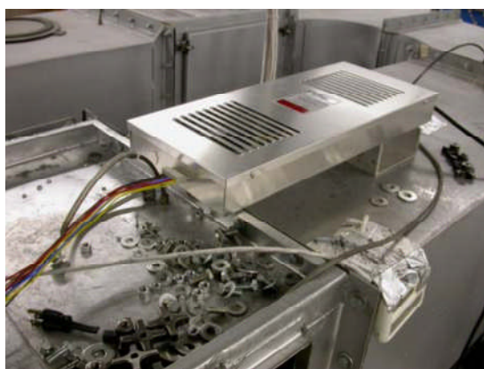
Figure 2-1. Ballast box installed on the outside of the test rig.

Table 2-1 provides information on the system as supplied by the vendor. Figures 2-1 and 2-2 provide views of the device as tested, installed in accordance with the manufacturer’s specifications.