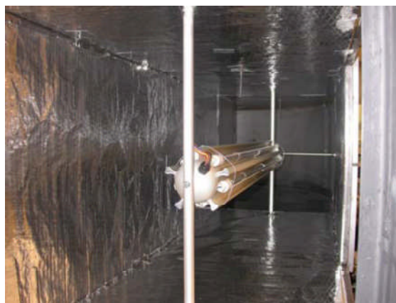
Figure 2-2. Device installed inside the test rig. There are 5 lamps. A reflective surface was placed in the duct.