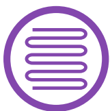
Installation: Facing the evaporator coils (in-duct)