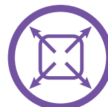
Purifies up to: 4,000 sq.ft.