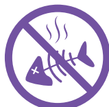
Eliminates odors and chemical contaminants