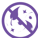
Eliminates volatile organic compounds (VOCs)