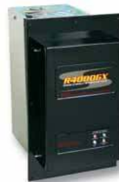
From 1500 sq. ft to 4000 sq. ft Home *Commercial 2000 cfm model also available