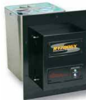
Up to 1700 sq. ft Home