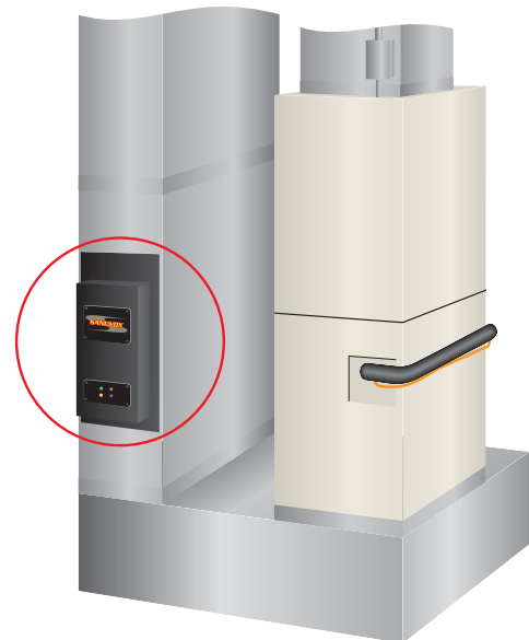
Return or Supply Plenum Installation