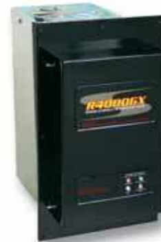
From 1500 sq. ft to 4000 sq. ft Home *Commercial 2000 cfm model also available