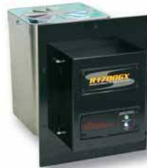
Up to 1700 sq. ft Home