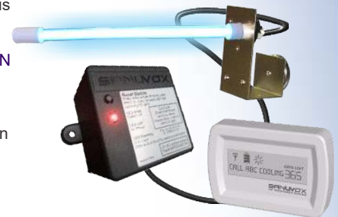
Sabber Pro Wireless "Stick-Light" UV Coil Cleaner

When an Object Purifier (Stick-Light) is installed PERPENDICULAR to the airstream, the air spends very little contact time with the UV Energy. When a UV Air Purification System (Sanuvox RMax) is installed, the Lamp is mounted PARALLEL to the airstream. By having the Lamp installed PARALLEL in the ductwork, it allows for the contaminants in the airstream to spend 2,400% MORE CONTACT TIME with the UV Energy. With more contact time, more UV is delivered to the contaminants in the air, resulting in a much higher kill.