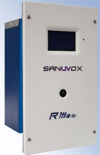
Sanuvox RMax In-Duct UV Air Purification System